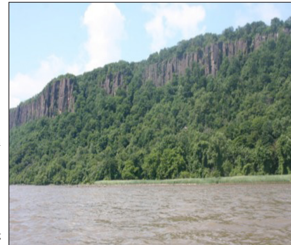
The Palisades Cliffs in Summer

The successful legal appeal and the agreement with LG ensure that the Palisades have, once again, been saved. The 200 million year old cliffs will remain an expanse of green in the NYC metropolitan area. This conclusion would not have been possible without the hard work of hundreds of people across the country. The Conservancy is thankful to everyone who spoke up to protect the Palisades. We are proud to have been a part of the battle to save the cliffs and consider ourselves fortunate to be among your company. Well done!